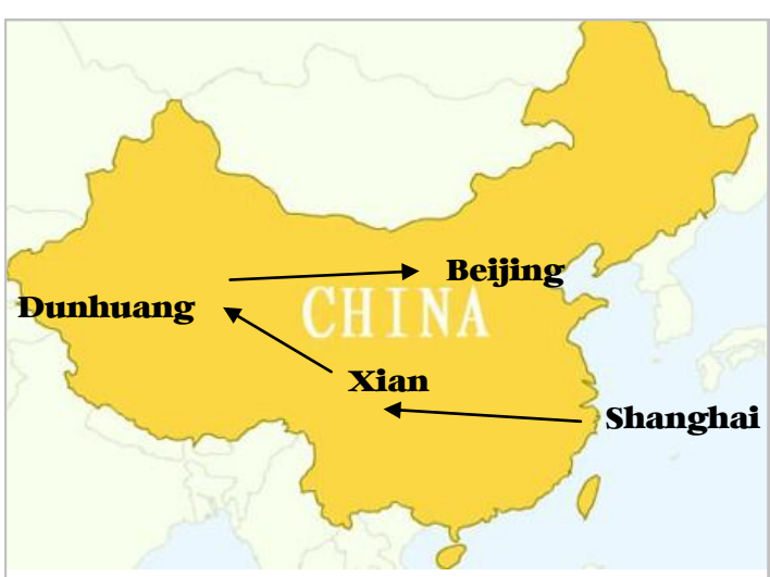
Day 1 - May 7, 2015 Fly Delta Airlines Non-Stop Seattle to Shanghai

Highlights of Itinerary—subject to change